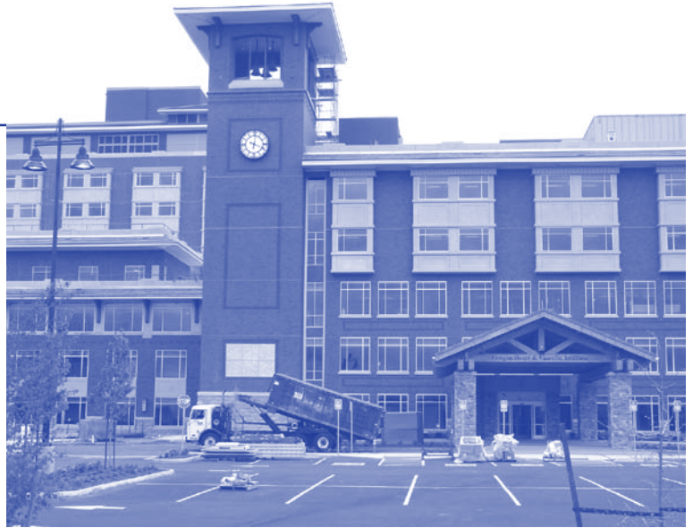
Sanipac hauled 300 tons of construction waste a month from RiverBend and diverted most of it from the waste stream.

Sanipac is proud to be an active partner in the growing number of green buildings in our community.